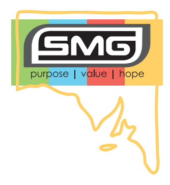
Supporting School Communities Across South Australia